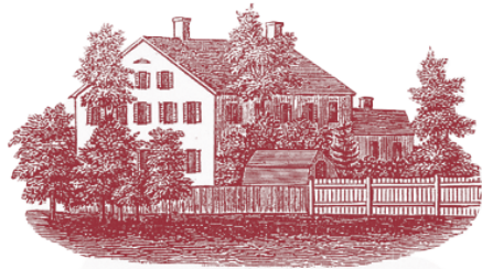
Jemima Wilkinson's House

The Yates County History Center, founded in 1860, is the fourth oldest historical society in the State of New York. Comprised of the Oliver House, the L. Caroline Underwood Museum, and the Scherer Carriage House, we preserve and interpret the history and culture of Yates County, New York.